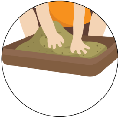
BRINCAR COM AREIA